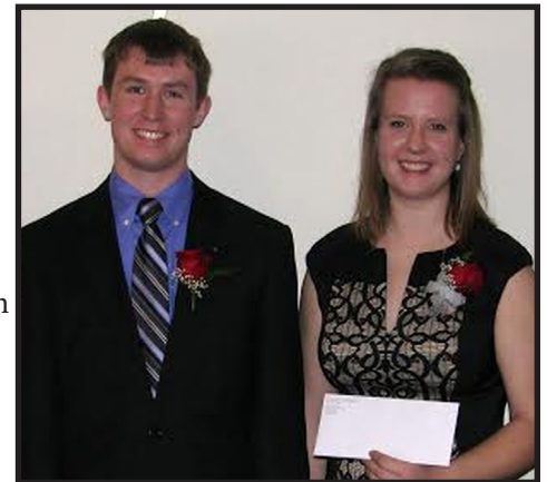
Previous Siem Memorial Award Recipients